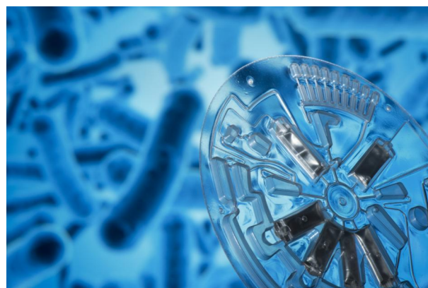
Centrifugal microfluidic LabDisk platform where the MagSi-DNA mf beads were first used [1]